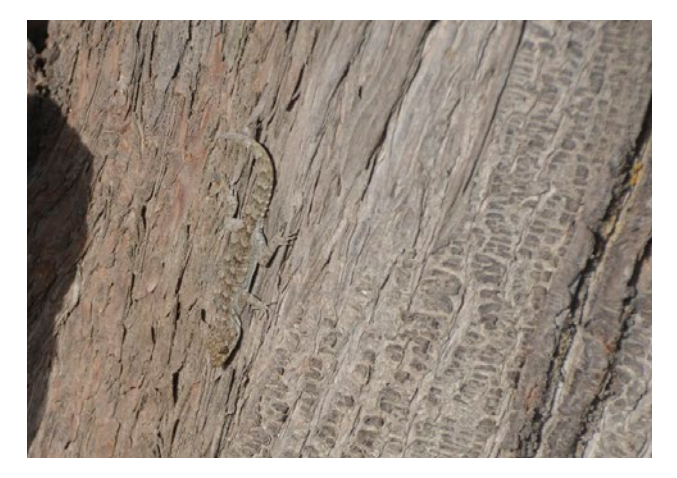
Fig. 2. Mediodactylus kotschyi on the bark of a tree on Kimolos Island, 34.79 N, 24.58 E, 7 May 2015.

very well be false-absences. This can only be supported (or refuted), however, by future surveys. That said, we have no reason to believe that reported absences are more likely for either the tree or for the rock microhabitat, or for different geographic locations, and thus false absences are unlikely to alter our conclusions.